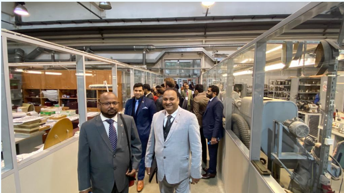
Indian business delegates during the visit to Imperial Porcelain Factory, St. Petersburg