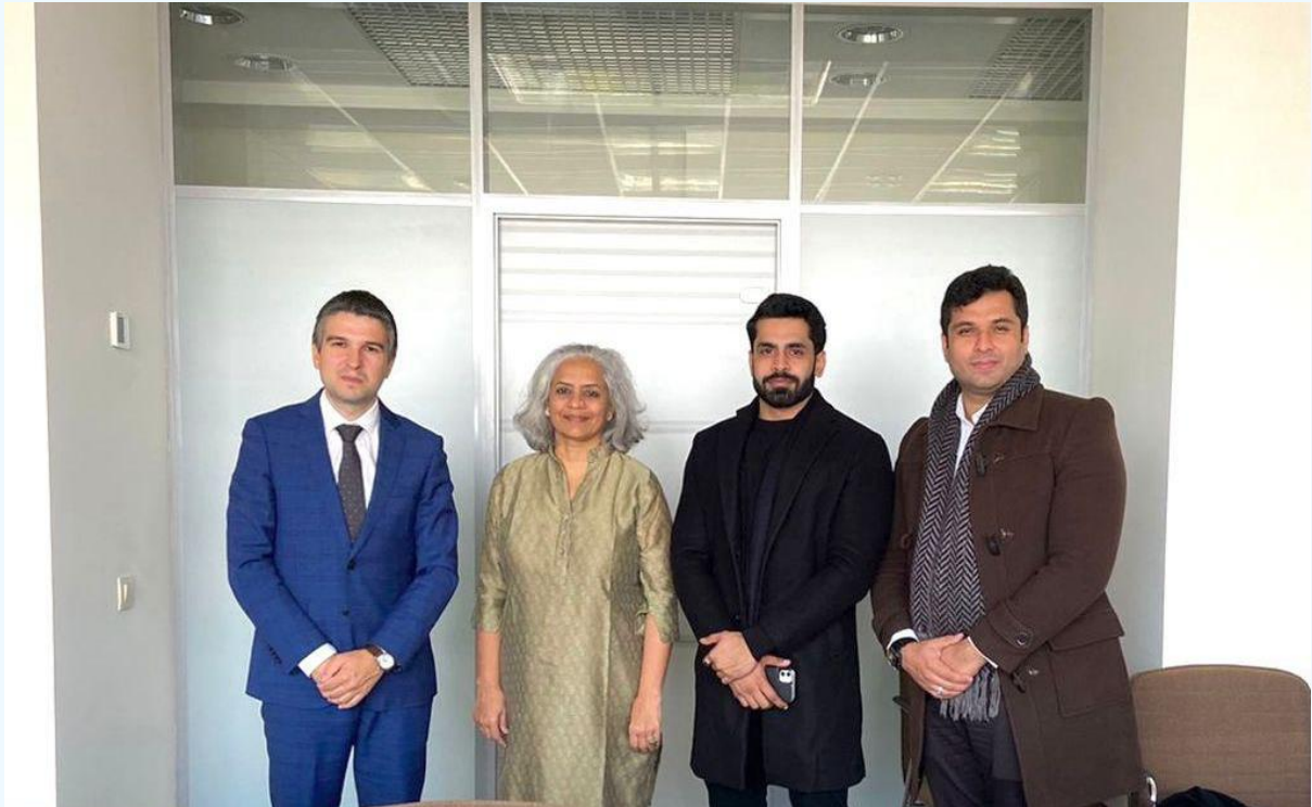
ASSOCHAM officials during meeting with Rosscongress Foundation to discuss collaborative future initiatives