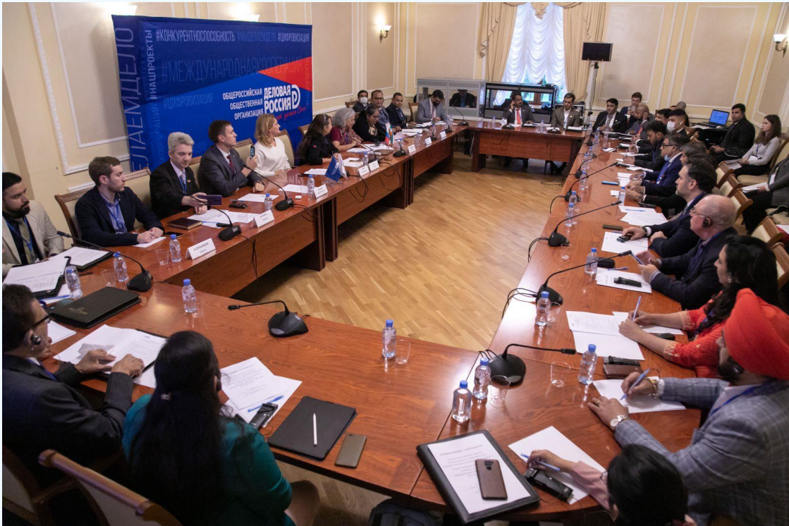
Participants and Dignitaries during the conference on “Current challenges of the trade and economic cooperation between Russia and India in the post-COVID-19 era”