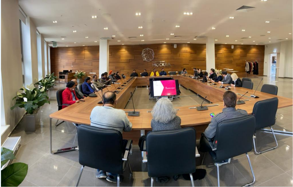
Indian business delegates interacting with the representatives from SEZ Technopolis Moscow, during the site visit