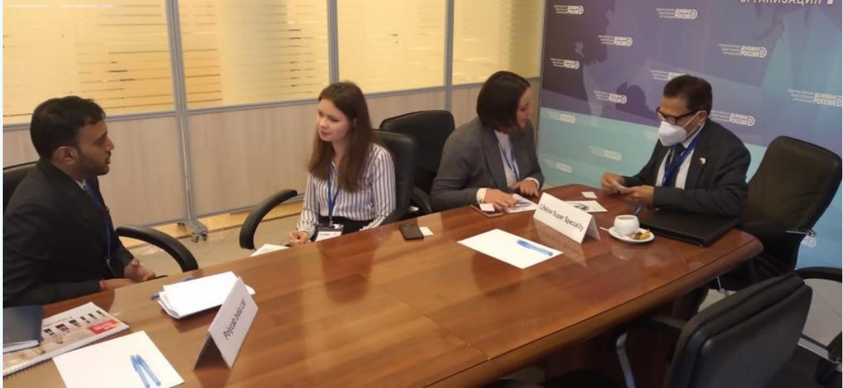
Indian companies meeting their Russian counterparts during B2B meetings